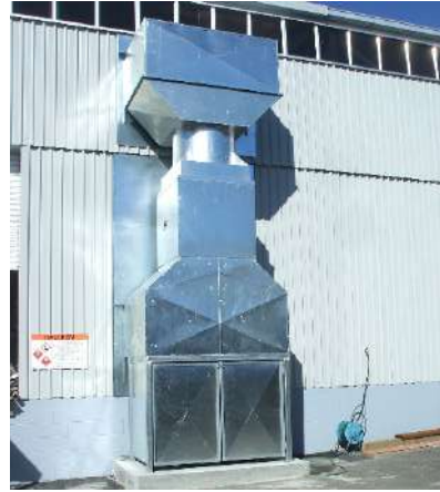
Heated Supply Air