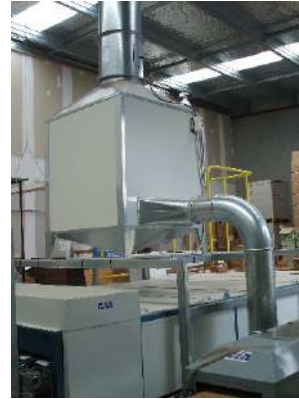
Auto Paint Line