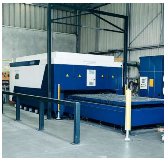
Han's Laser 3015/3KW