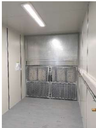
Composite & Stone Cartridge Filter