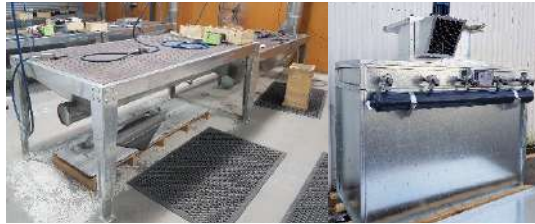
Down Draft Extraction