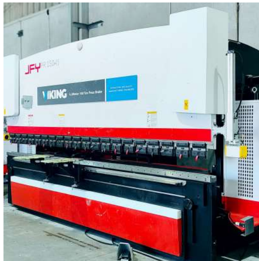
JFY 100/3100 & 160/4200 Press